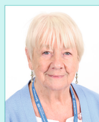
Carole Oldcorn Public Governor