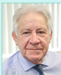
Phil Curwen Public Governor