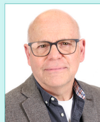
Darrell Brooks Public Governor