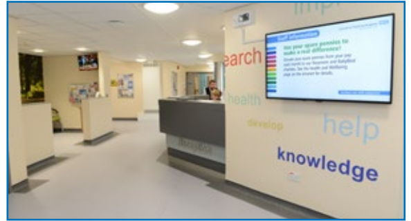
Our new Research Centre