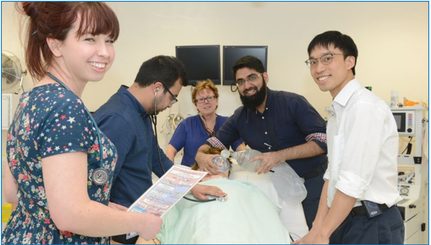
Teaching in our Sim Lab