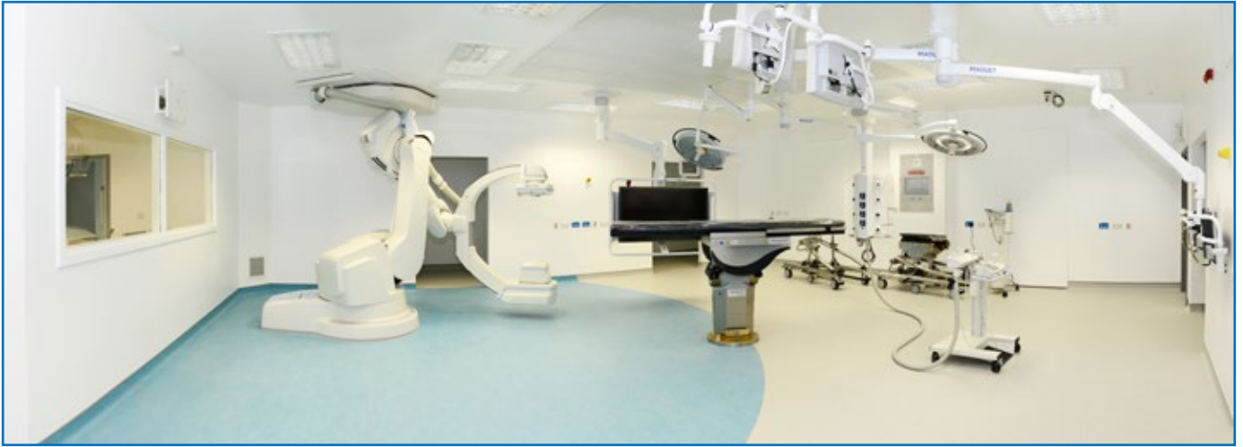
New Hybrid theatre