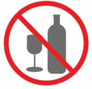
Do not drink Alcohol

At 6pm - Empty Dose 1 of Plenvu into a container/jug with 500mls of water and stir. It will take about 8 minutes for the Plenvu to completely dissolve. Sip this slowly over 60 minutes along with 500mls (minimum) of clear fluids.