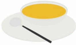
Clear soups no bits